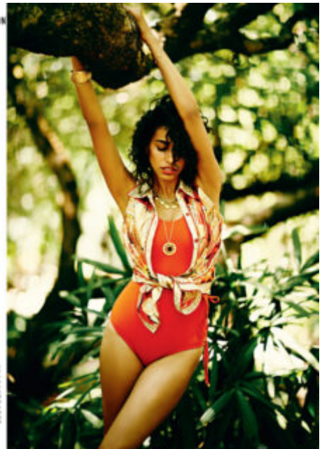
Swimsuit: P. 1000; Scarf: Longi; Shoes: Jimmy Choo; Jacket: M. 1000; Necklace: M. 1000; Bracelet: M. 1000; Ring: M. 1000; Earrings: M. 1000; Hair: M. 1000; Makeup: M. 1000; Styling: M. 1000; Photo: M. 1000